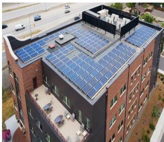
OFFICE / HOUSE