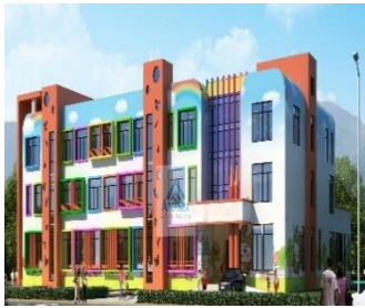
COLLEGE / SCHOOL